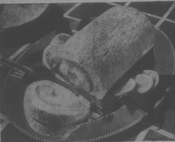
The family will enjoy this orange-flavored treat.