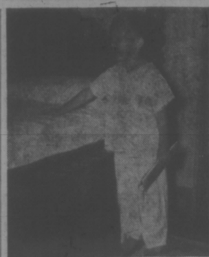
Ready for Slumberland.

COTTON sacks are doing double duty in these days of fabric shortages, the Home Editor of nationally-circulated Capper's Farmer points out. With a little ingenuity and various sizes of bags, one can make interesting things for the home and smart pieces of clothing for the family. "Applied cherries and red-embroidered rickracks give accent to these chic mother-daughter outfits," this Capper's Farmer expert writes. "Rough-weave, bleached cotton sacks were used. When preparing the sacks for sewing, rip the stitching and remove any printing by soaking them overnight in thick soapsuds. In the morning wash them in warm, soapy water, rubbing printed parts between the hands. If this does not remove all marks, boil