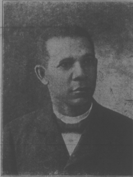
BOOKER T. WASHINGTON

Booker T. Washington, slave-born Negro who died in 1915 after becoming famous for his writings and efforts in advancement of his people, last week became the first Negro to win election to the hall of fame for great Americans at New York university. Founder of Tuskegee Institute, Ala., in 1881, Mr. Washington, born in Virginia, was freed by the Civil War.