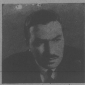
DR. ADAM POWELL, JR.

THE inexpensive ball of crocheted thread is stepping into the breach left by the appropriation of materials and machinery for war purposes. American women are learning that conservation begins at home. Only six balls of pearl cotton are required to crochet this convenient carry-all bag, in which you can comfortably carry your purchases to help conserve tires, rubber and gas. The glass protectors which can also be crocheted easily and inexpensively will protect your polished table tops from spillage. Directions for crocheting these useful articles may be obtained by sending a stamped, self-addressed envelope to the Needlework Department of this paper, specifying design No. 909B.