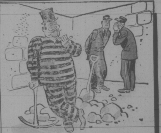
"That's High-Hat Harry—he only steals cars with Armstrong Tires."

BUY DES MOINES MADE ARMSTRONG TIRES from Mid-Continent Distributing Corp. DES MOINES LEADING TIRE OUTLET 811 Keo Way Phone 4-7222