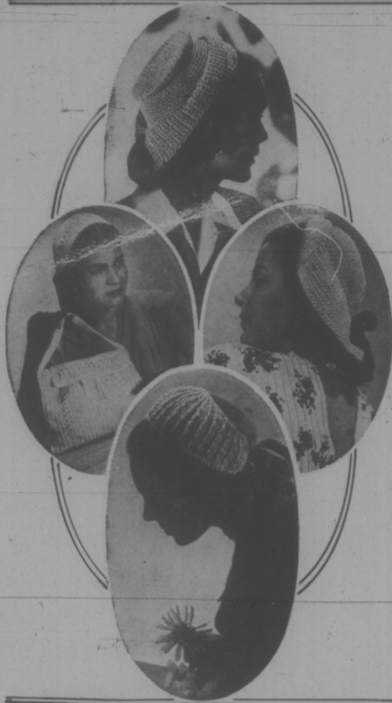
THE HAT MAKES THE WOMAN

It has been said that clothes make a man and it is just as true that the hat makes the woman.