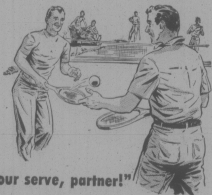
"Your serve, partner!"

Congratulations to this Paper upon its Growth! Frankel's