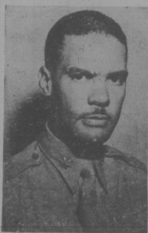
COL. B. O. DAVIS, Jr.

One of the guests here for the first annual convention of the American Veterans Committee was Col. Benjamin O. Davis, Jr., commanding officer of Lockbourne Air Base, Columbus, Ohio.