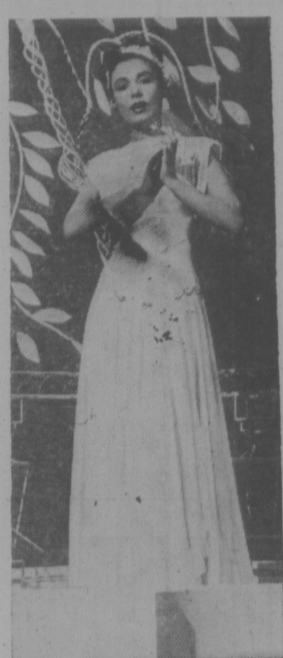
LOVELY LENA— —Among the great galaxy of stars appearing in MGM's Technicolor musical "Till the Clouds Roll By" is lovely Lena Horne, the popular songstress who is featured in three elaborate production numbers in the film.

Subsidiaries Wanted—Good Commissions 1620 Walker St. Des Moines, Ia. Phone 6-3347