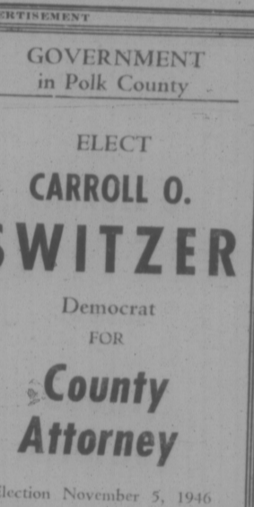
ELECT CARROLL O. SWITZER, Democrat FOR COUNTY ATTORNEY. Election November 5, 1946.