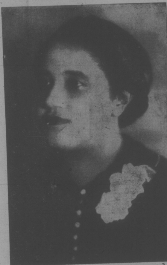
MRS. MARJORIE STEWART JOYNER

Mrs. Marjorie Stewart Joyner of Chicago, Ill., national president of the Madame C. J. Walker's Beauty Colleges and president of the United Beauty School Owners' and Teachers' Association, will be guest speaker at the commencement exercises of the Crescent School of Beauty Culture, Sunday evening, Oct. 27, at the Corinthian Baptist church.