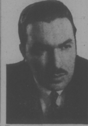
A. C. POWELL

WASHINGTON, D. C., (NNPA)—In the organization of the Eightieth Congress, which was completed last Thursday, Representatives Adam C. Powell, of New York, and William L. Dawson, of Illinois, were given assignments on important committees with the approval of the Democratic caucus of the House.