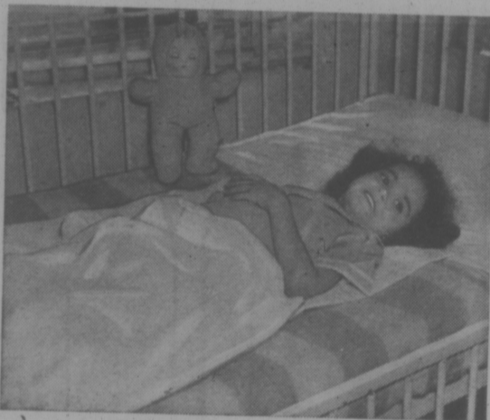
Denver County Chapter, Denver, Colorado, provides hospitalization and assists in meeting medical care costs for this child. Funds for care of polio victims are raised by the National Foundation for Infantile Paralysis through the March of Dimes, January 15-30.