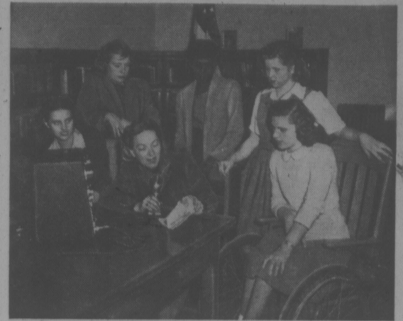
Speech instruction for young polio victims at the New York State Reconstruction Home at Haverstraw, N. Y., is one of various rehabilitation jobs handled by actress Helen Hayes. Miss Hayes, who is on the Board of Visitors, as well as an instructor, is an enthusiastic supporter of the March of Dimes Campaign, January 15-30. New York State Chapters of the National Foundation for Infantile Paralysis provide care for many of the children at the Home with funds raised during the March of Dimes.