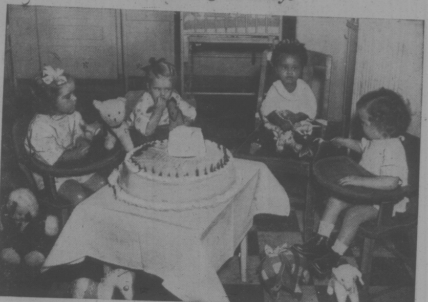
Joint party for these polio victims who have the same birthday was given at the Los Angeles Orthopedic Hospital where these children are assured treatment by the National Foundation for Infantile Paralysis. Sole support of the Foundation comes from the March of Dimes, January 15-30.