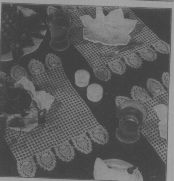
Send a stamped, self-addressed envelope to this paper and receive complete instructions on how to make this luncheon set at home.