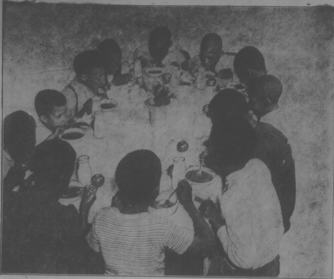
Children all over the United States have been learning their A B C's, but millions of them have not been getting their A B C's in valuable vitamins. These youngsters are getting theirs in a delicious school lunch which nourishes their growing bodies and keeps them strong and mentally alert. The American-grown farm products used in these lunches are provided by the Agricultural Marketing Administration of the U. S. Department of Agriculture. Last school year 1,140,784 colored children received lunches under the Community School Lunch Program.

moderately warm iron under a press cloth. Rolling the wool in a damp sheet is a simple way to dampen it. Dip a sheet in water, wring it out, then spread it flat on a table and lay the wool material, flat and straight, on the sheet. Roll sheet and wool together firmly but not tightly. Allow to stand overnight. Then press wool on the wrong side under a dry press cloth with no pulling or stretching.