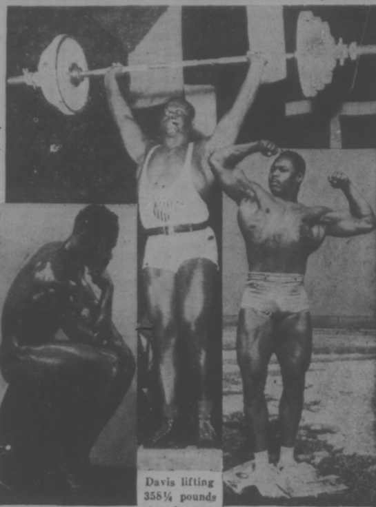
Not the Thinker—but thinking' about the '48 Olympics. Here he is—The Pride of the York Barbell Club

In the press, he lifted 297½ pounds; in the snatch, 303½ pounds, in the clean and jerk, 358½ pounds—a total of 958 pounds! If the terms confuse you,