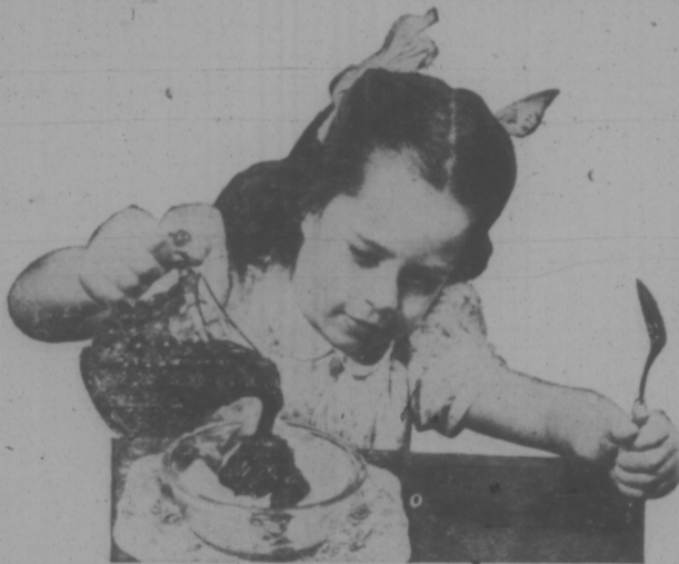
Frozen berry purees over ice cream make tasty sundaes in winter or summer.

BERRIES make mighty tempting summer desserts—and just as tempting winter ones. For by freezing the finely flavored berries you can have summer treats the year around, writes Donald K. Tressler in Capper's Farmer, a leading magazine.