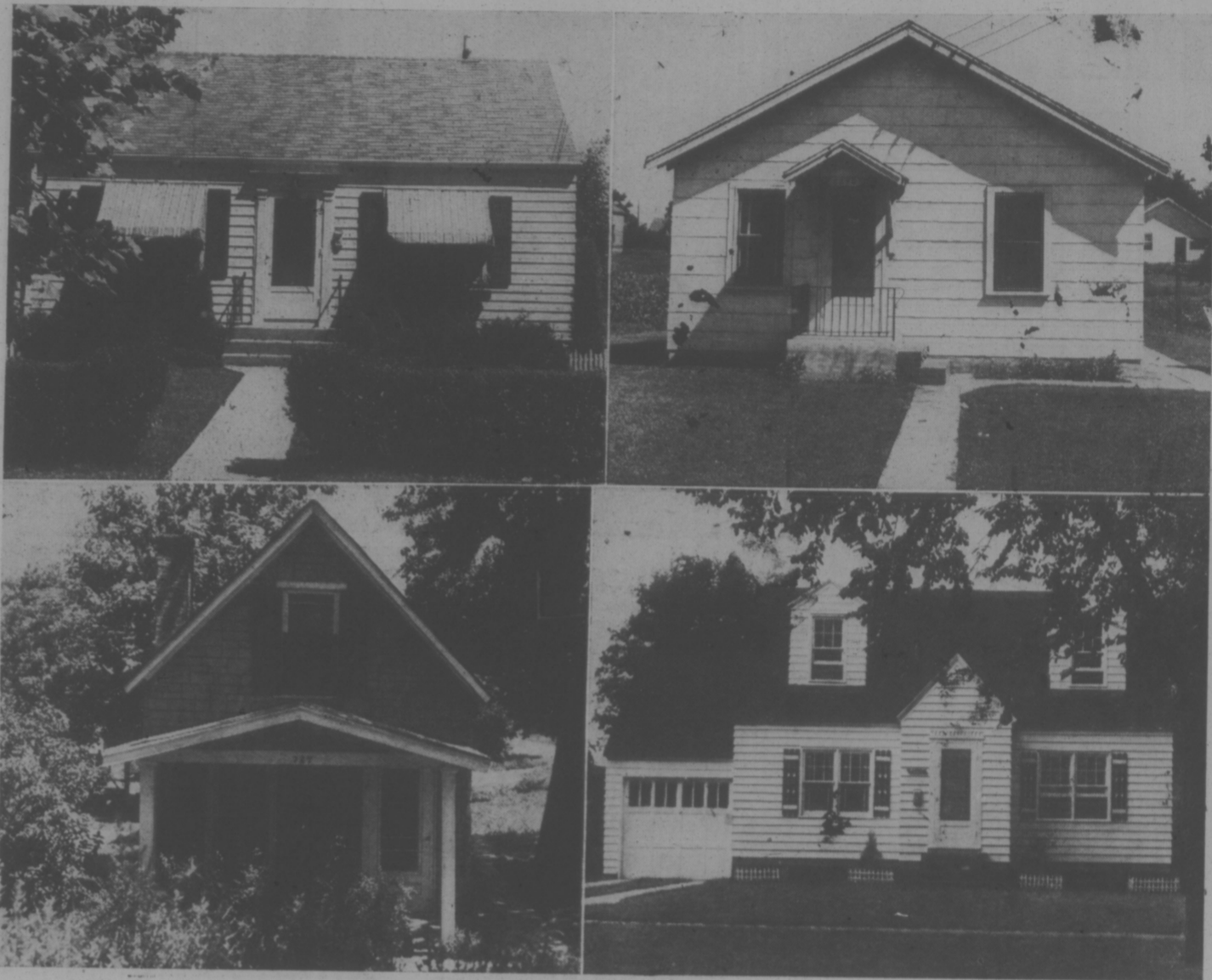
Pictured above are Four Winners in the 1946 Clean-Up Drive. You still have time to file your blank—found on page five—so as to qualify in the drive. Participation in the Clean-Up campaign is a mark of good citizenship and at the same time shows your interest in a better looking home, community and state.

Getting Well From TB Tuberculosis can be cured. Every year thousands of people are discharged from tuberculosis hospitals and return to useful lives. Those whose disease is diagnosed early have the best chance of recovering.