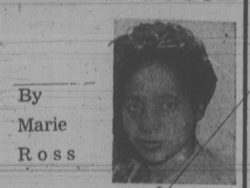
By Marie Ross