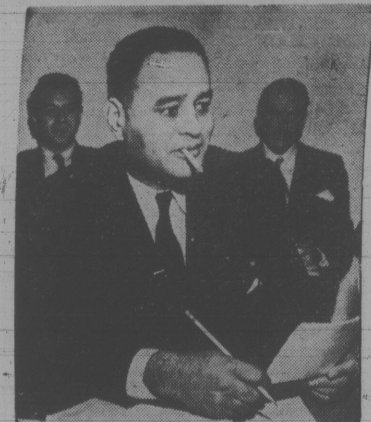
DR. RALPH BUNCHE

In arriving at the decision to continue with the United Nations, Dr. Bunche let it be known that he also was swayed by his belief that the UN is "the great hope of all of us for peace in the world." He added that he thought "it is marching away from it for two years for (SEE EDITORIAL PAGE)