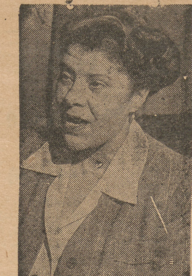
MRS. PAUL ROBESON.

in the United States have "fought two wars for democracy and won none." She added that colored Americans did not believe that "a third war for democracy abroad will win any democracy for them at home."