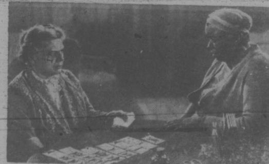
The Two Ethels, Ethel Barrymore and Ethel Waters, great ladies of the theater here represent two great ladies of the South in their Darryl Zanuck's production of "Pinky," the story of a girl who passes for white, which begins Sunday at the Des Moines and Roosevelt theaters. They support Jeanne Crain, Nina Mae McKinney, Bill Lundigan in the Twentieth Century Fox drama.