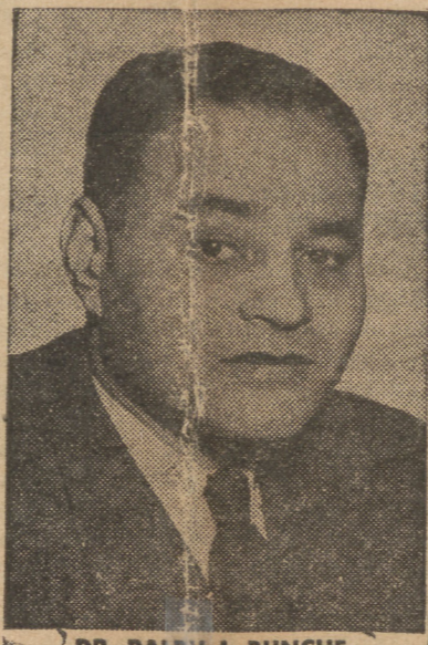
DR. RALPH J. BUNCHE

Dr. Ralph J. Bunche, who turned down an appointment as Assistant Secretary of State because of Washington's "Jim Crowism", charges in the February American Magazine that "American antiracial and anti-religious practices make a mockery of both the Constitution and the Charter of the United Nations."