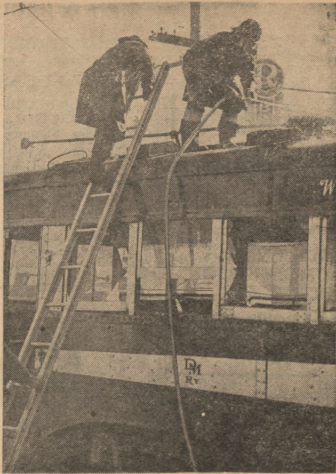
Two firemen extinguish blaze on roof of a street car following explosion in control box last Saturday at Tenth and Center streets. Three passengers in the crowded Urbandale trolley broke glass and jumped out of windows.