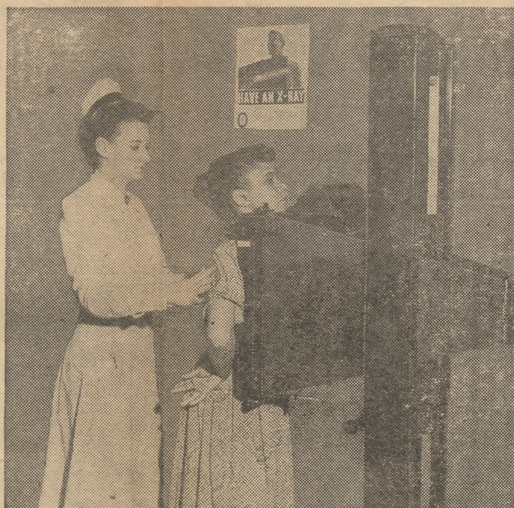
This young lady is taking no chances. She wants to find out whether or not she has tuberculosis and she knows the disease can be detected by means of a chest X-ray. Christmas Seal funds, sole support of the 3,000 tuberculosis associations in this country, help make possible X-ray services in many American communities.