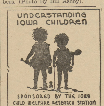
Understanding Iowa Children

Sponsored by the Iowa Child Welfare Research Station