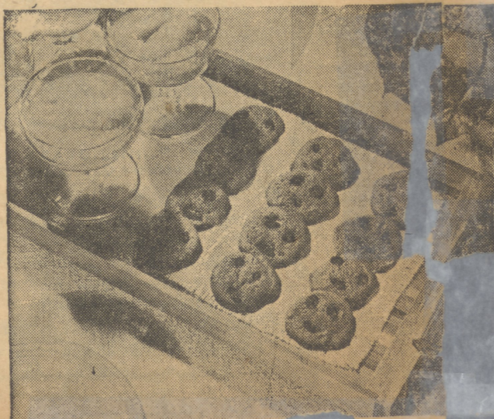
Plump, spicy molasses cookies are popular.

Children love to discover chewy molasses honey desserts, good with smooth green apple sauces.