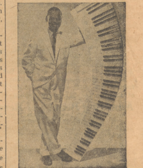
EARL (FATHA) HINES