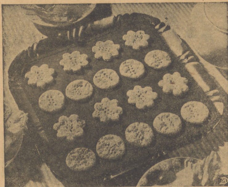
Cream cheese and watercrust supply the unusual flavor of these crisp wafers, good to munch as appetizers, good to eat with soups and salads.

Neither a pastry nor a cracker but a little of both are the dainty cheese crispies pictured here. These tender, flaky crispies are cut from a cream cheese pastry flavored with watercrust.