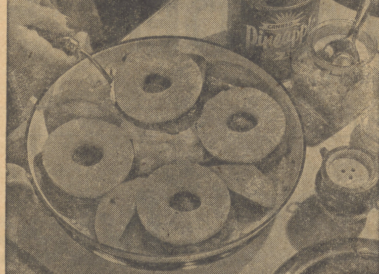
The exotic flavor of this dinner-in-a-dish belies its simple preparation.

Ham and Pineapple Skillet is sure to rate a special niche in your file of favorite recipes. Ground ham and beef patties—half and half—combined with sweet potatoes, glamorized with golden pineapple is one of those easy-on-the-cook family dinners that's complete when you add a tossed green salad, rolls, a beverage and a simple dessert.