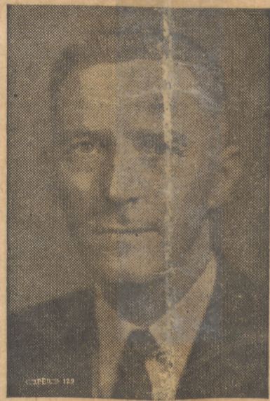
GOV. LEO A. HOEGH

"It shall be the policy of the state of Iowa that no person within its boundaries shall be deprived of the right to work at his chosen occupation for any employer, public or private, because of race, creed, color, national origin or ancestry," the resolution stated.