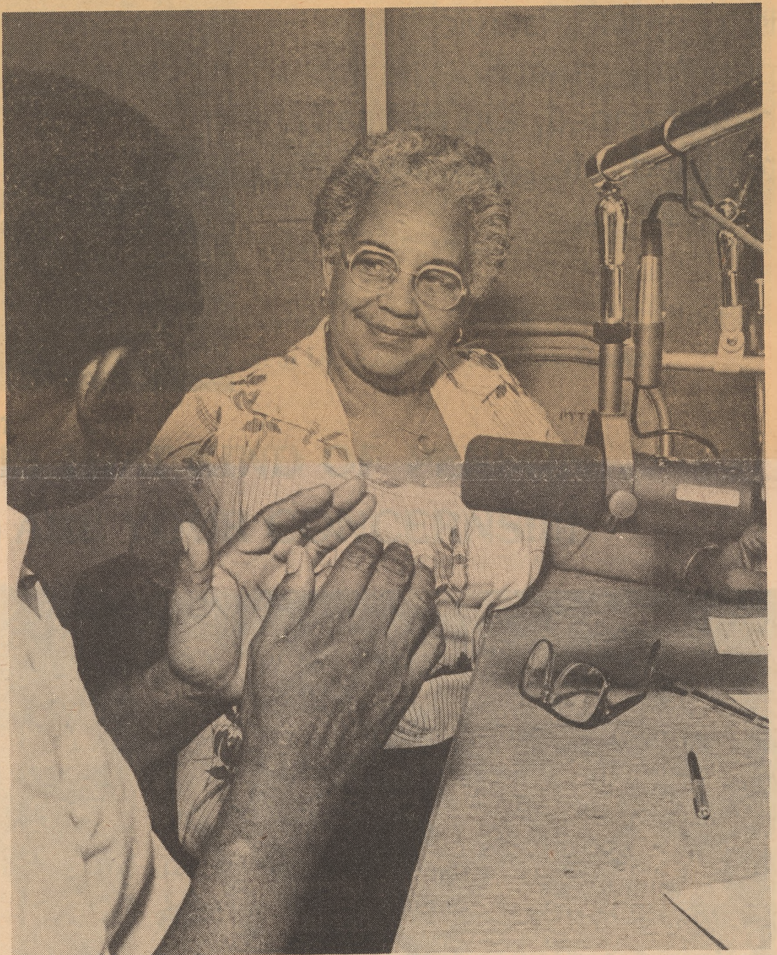
Photo at KBBG Studios