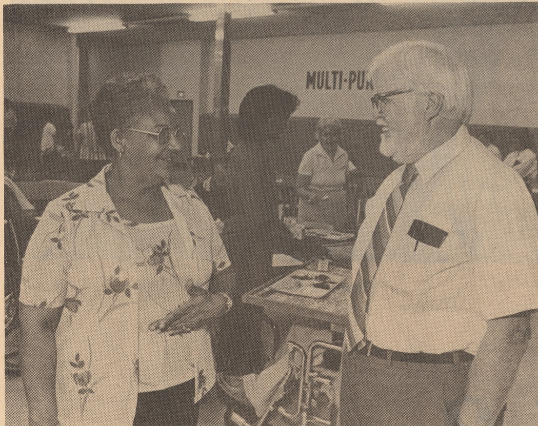
Key 7 Program Activity Center for Developmentally Disabled.

There must be effective use of the funds and resources available to the county through long-range planning that sets over-all goals and priorities, determines consistent objectives and utilizes implementation strategies that are realistic and feasible. It is important that we stay ever mindful of the cost of government services and strive to keep them as efficient as possible.