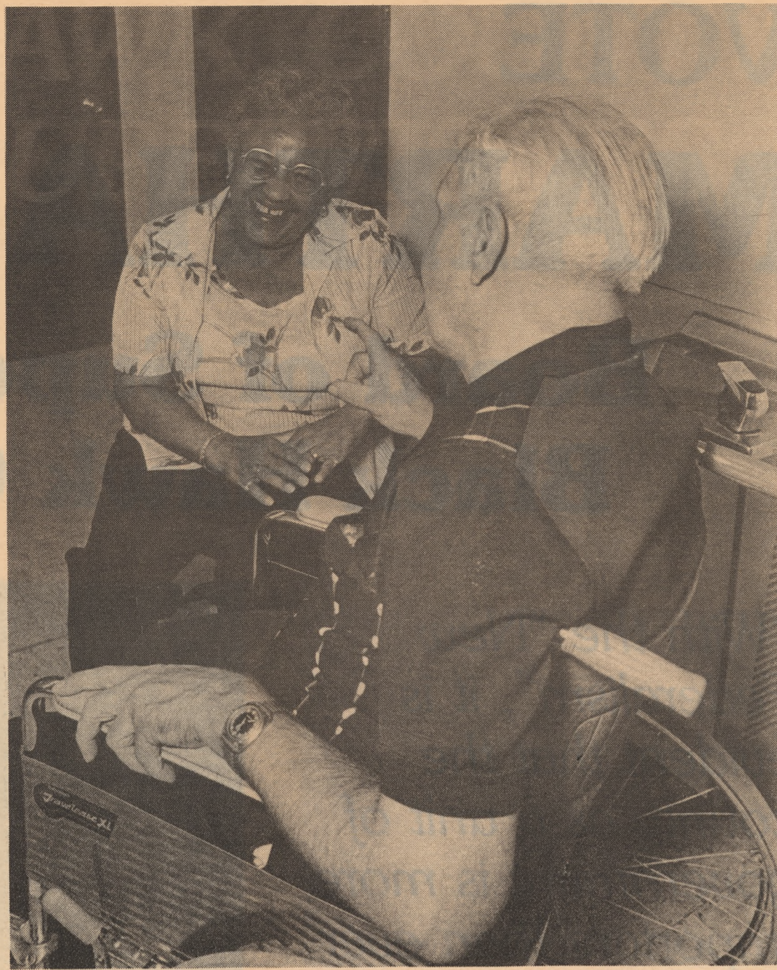
Newell Post Adult Day Care

We need to be aware of the county-funded programs and how effective and efficient they are in carrying out the activities for which they exist. Yet, we must never lose sight of the fact that their very reason for being is to provide services to people — the elderly, the handicapped, the mentally retarded, etc.