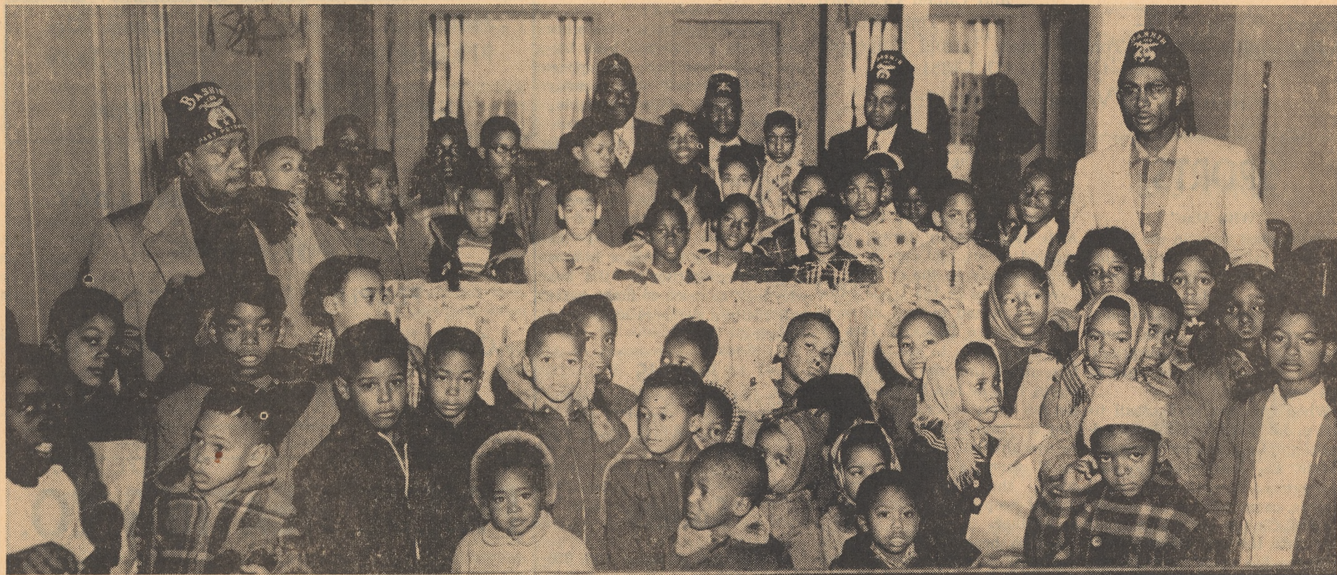
SOME OF THE MEMBERS AND OFFICERS of Bashir Temple No. 156 are shown in this picture. They helped sponsor the annual Christmas party for the kiddies.