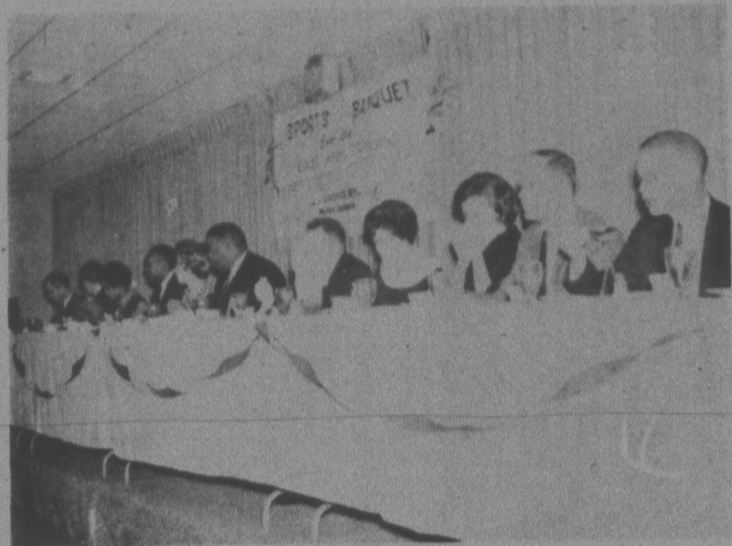
EAST HIGH BANQUET