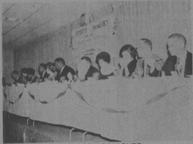
EAST HIGH BANQUET