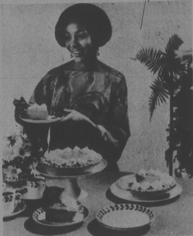
A SPRING PARTY PIE guests will shout your praises when you serve Coffee Pastel Party Pie. Made with instant decaffeinated coffee, orange flavor gelatine, and vanilla ice cream, this party dessert will soon head your list of favorites

Also ask whether we can cure the disease of prejudice and prepare all children for life in a multiracial world if white children grow up and go to school in isolation from Negroes.