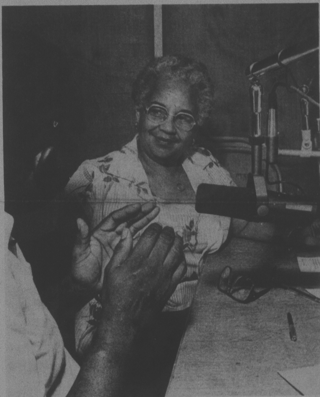
Photo at KBBG Studios