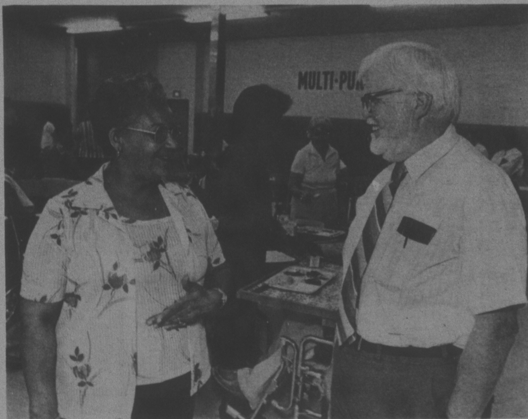
Key 7 Program Activity Center for Developmentally Disabled.

There must be effective use of the funds and resources available to the county through long-range planning that sets over-all goals and priorities, determines consistent objectives and utilizes implementation strategies that are realistic and feasible. It is important that we stay ever mindful of the cost of government services and strive to keep them as efficient as possible.