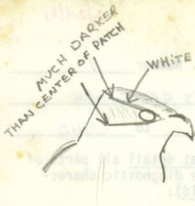
BACK OF HEAD