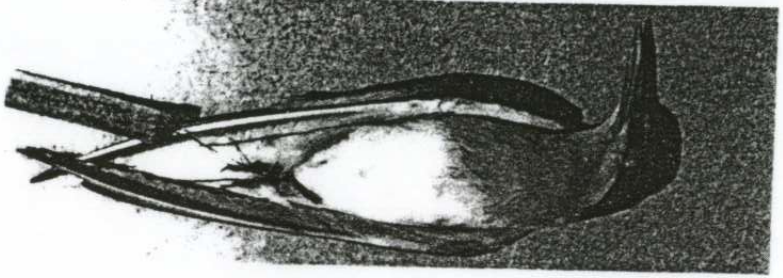
Figure 7. Least Tern (#2519) taken on the Missouri River. Vol. 62, No. 1