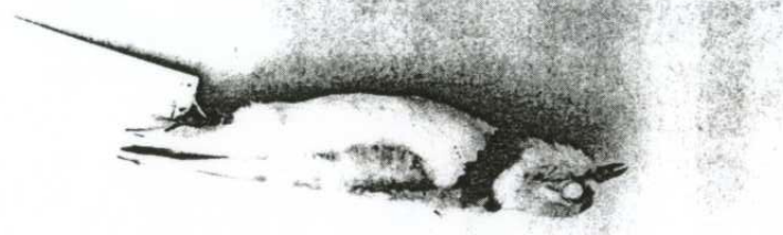
Figure 5. Piping Plover (#1771) found dead near Council Bluffs, Iowa. Iowa Bird Life, Winter 1992

Sandhill Crane: Bob Kurt of the D.N.R. found an injured male at Otter Creek Marsh, Tama County on 13 November 1979; it died on 24 November 1979 (#1651, IBL 49:112). Piping Plover: Babs and Loren Padelford of Bellevue, Nebraska found a male dead at the Iowa Power and Light Ponds near Council Bluffs, Pottawattamie County on 11 June 1983 (#1771, Fig. 5). There are few Iowa specimens of this endangered species.