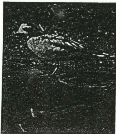
Red Phalarope, Saylorville Reservoir, 28 Sep 1991.