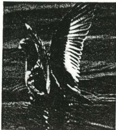
Red Phalarope, Saylorville Reservoir, 28 Sep 1991.

tail. It had a very noticeable light-grayish back. Its relatively short bill was very thick, stout, and black. It had a very black crown and a strong black bar through and behind the eye. In flight, it had a very distinctive wingstripe. This bird appeared to be almost into its basic plumage. The bird was running along the shore, later flew around, landed in the water off shore by a fishing boat, stayed there for a while, and then was gone. Based on its plumage differences, it was probably a different bird from the two reported earlier in the fall.