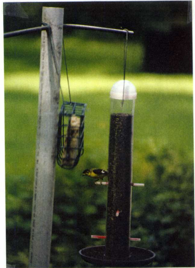
Lesser Goldfinch P-0627 Rockford, Floyd Co., IA 5 Aug 1999 Ellen S. Montgomer