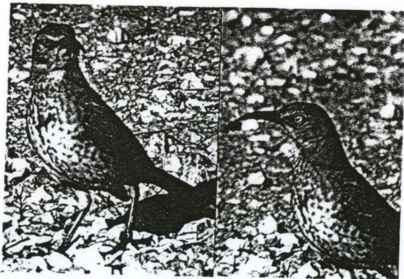
Curve-billed Thrasher, Manona County, 13 May 1988.

The wing bars and distinctly mottled underparts indicate that the bird was of the more southerly race, Toxostoma curvirostre curvirostri . There are three other records of Curve-billed Thrasher in Iowa: 25 June 1975 at Spirit Lake, September 1980 to March 1981 at Rathbun Reservoir, and 17 November to March 1981 near Solon.