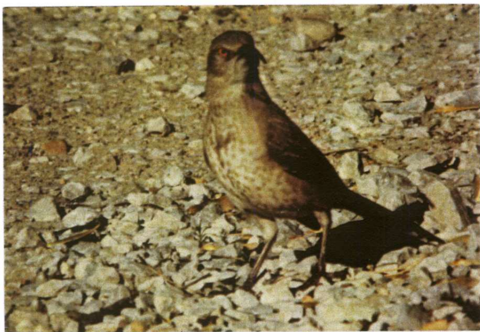
Curve-billed Thrasher P-0259 Badger L., Monona Co., IA 13 May 1988 Tom Sorensen