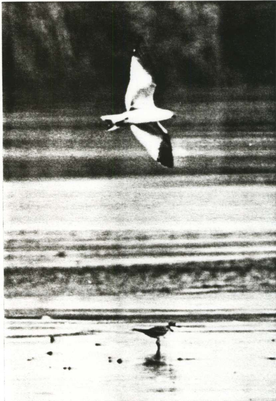
Sabines Gull SAC Co. LAKEVIEW, FL. XLM Pogonose ©1994 Sept 10, 1994