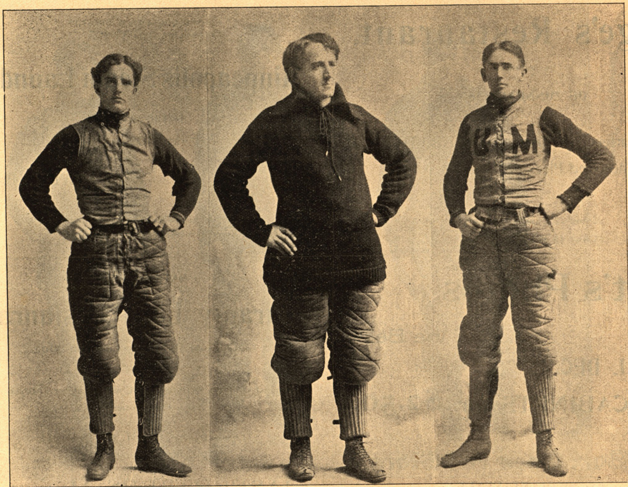
From Photo by O. F. STAFFORD & CO., 520 Nicollet.