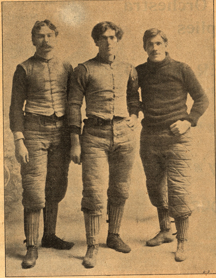
From Photo by O. F. Stafford & Co., 520 Nicollet.