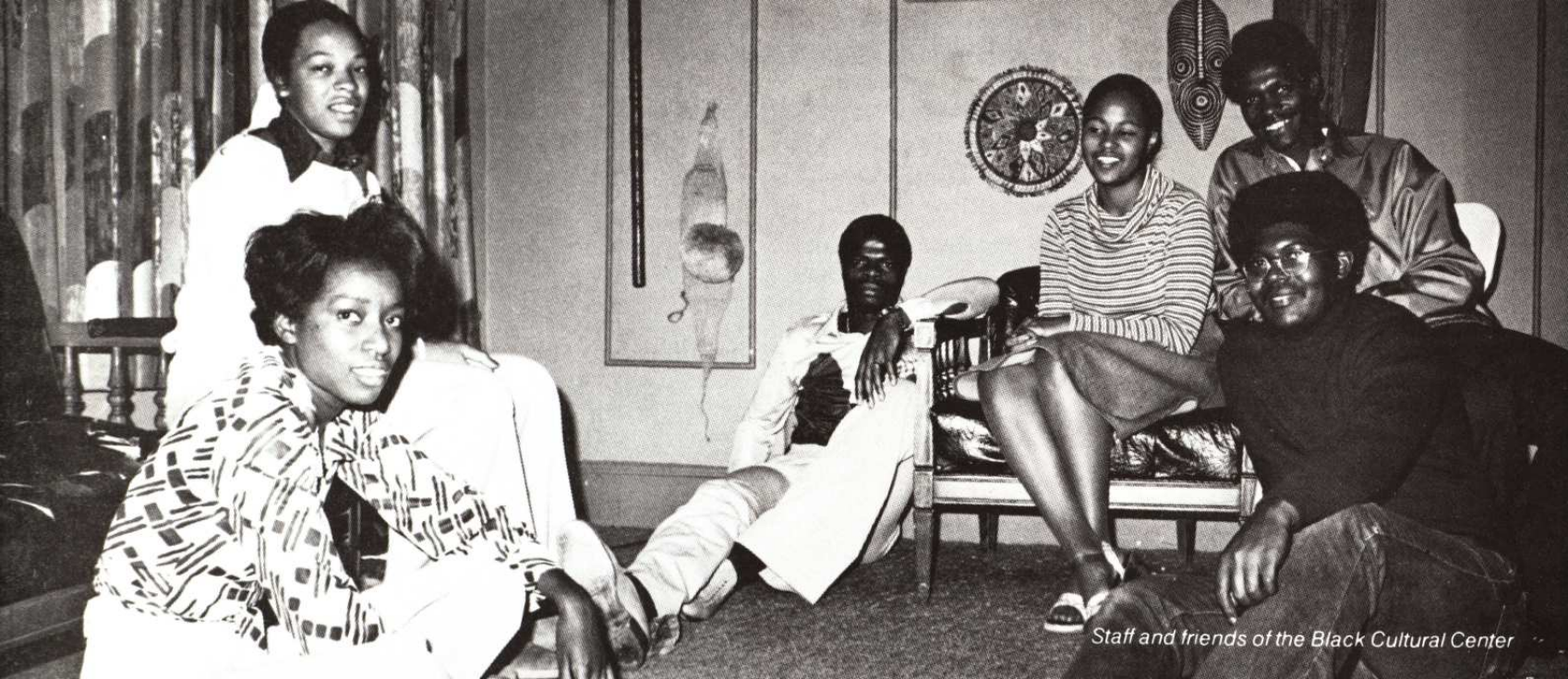
Staff and friends of the Black Cultural Center